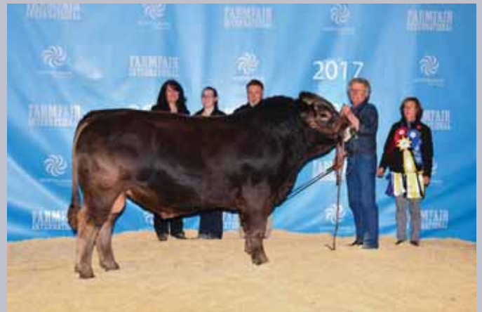
Photo: Swiss Tradition Crackerjack, Reserve Champion Bull

Late August, we hired a young lady, interested in Braunvieh, to help us on the farm. She did a great job with training the cattle for Farmfair International. She