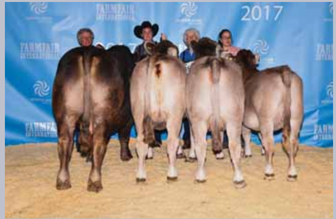
Photo: Swiss Tradition Breeder's Herd (L to R): Swiss Tradition Crackerjack, Swiss Tradition Delux, Swiss Tradition Thea, Swiss Tradition Gold