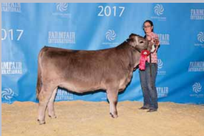
Photo: Swiss Tradition Gold 2nd – in the end, another made it because that dam was in better condition, but had a smaller calf.

June 6, I attended the 4-H competition in Camrose. One of the kids had purchased a heifer from us and showed her this year again, with her first calf at side. They placed third in a group of five. The calf was very growth and the judge had a tough decision whether or not to place them